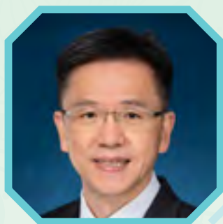
孫東 SUN Dong

香港特別行政區 創新及科技局局長 Secretary for Innovation and Technology of HKSAR Government