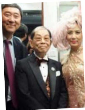
顧嘉輝 Dr. Joseph Koo

顧嘉輝 (MBE, GBS, BBS) 人稱「輝哥」，粵語流行曲奠基者。顧氏精於作曲編曲，寫下逾千首家傳戶曉作品，知名度遍及華人地區。他栽培不少香港著名歌手，如葉麗儀、鄭少秋、汪明荃等，有「樂壇教父」之稱。