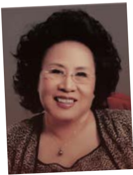
郭淑珍 Guo Shuzhen

中國著名女高音歌唱家、音樂教育家，享受國務院政府特殊津貼專家。1952年畢業於中央音樂學院，1953年至1959年1月公派赴蘇聯莫斯科柴科夫斯基音樂學院學習（師從人民藝術家PKaTyjihCKaa葉·卡杜爾斯卡婭），獲優等畢業證書及優秀演唱家稱號，其名字被鐫刻在學院的大理石金榜上。