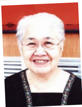
司徒志文 Zhiwen Situ

司徒志文是中國著名大提琴演奏家，教育家，原籍廣東開平。1933年出生於上海的一個音樂家庭，先後在上海國立音專、莫斯科柴科夫斯基音樂學院接受教育。師從舍輔磋夫、羅斯特洛波維奇等。1950年至2003年，先後任職於上海市人民政府交響樂團、中國青年文工團、中央歌舞團、中央樂團。參與完成多部重要經典及我國優秀的交響樂在中國的首演，其中包括擔任獨奏的德沃紇克降B調協奏曲。曾與卡拉揚、小澤徵爾指揮下與柏林愛樂樂團同台演出。