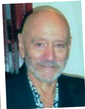
查理士·克里斯 Charles Kellis

美國男中音查理士·克里斯為資深聲樂教育家，早年畢業於美國茱利亞音樂學院，其後赴意大利隨多位名師深造聲樂，六十年代起於美國多間大學任聲樂教授，曾在美國茱利亞音樂學院聲樂系任教16年(1986-2002)，近年致力音樂教育。任教大師班及主持演說，擔任多個聲樂比賽的評委主席，發表多份聲樂評論。