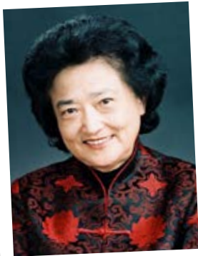
俞麗拿 Yu Lina

生於1940年，俞麗拿是中國著名小提琴演奏家、教育家，現任上海音樂學院小提琴教授，是名曲《梁祝小提琴協奏曲》全球首演的獨奏家。