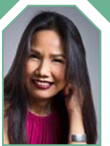
李靖 Li Jing