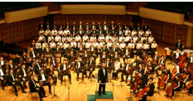
葵青管弦樂團由 1997 年至 2008 年間，擔任由「新城電台」每年主辦的除夕倒數活動之夜的管弦樂團演奏。由 2008 年度開始成為香港鐵路有限公司的長期合作伙伴，定期於香港站的 Living Art 表演藝術平台作演出。