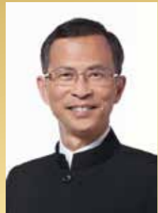
Mr Hon Jasper TSANG Yok-sing, GBS, JP The President of the Legislative Council, Hong Kong Special Administrative Region 香港特別行政區 立法會主席 曾鈺成 議員, GBS, JP