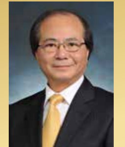
Mr Eddie NG Hak-kim, SBS, JP Secretary for Education, Hong Kong Special Administrative Region 香港特別行政區 教育局局長 吳克儉, SBS, JP